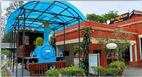
Gorakhpur Rail Museum & City Attractions

Gorakhpur offers several attractions like the Rail Museum, Planetarium (Taramandal), and vibrant local markets. The Rail Museum showcases vintage locomotives and the history of Indian Railways, making it an educational and fun place to visit. Along with parks and cultural spots, these attractions highlight the blend of history, science, and modern lifestyle in the city.