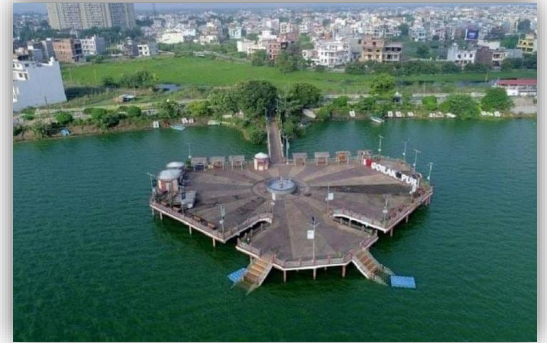
Ramgarh Tal Lake

Ramgarh Tal is a beautiful and expansive lake located near the city, offering scenic views and a peaceful environment. It is a popular spot for boating, picnics, and evening walks. The lake area has been developed with parks and recreational facilities, making it a favorite destination for both locals and tourists who want to relax in nature.